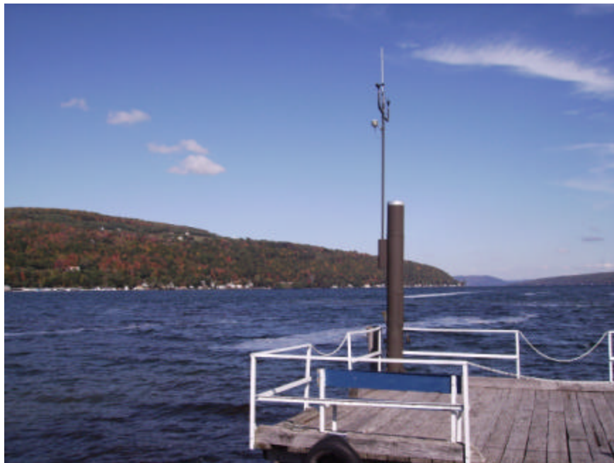
EES climate station and lake level gauge on Keuka Lake.